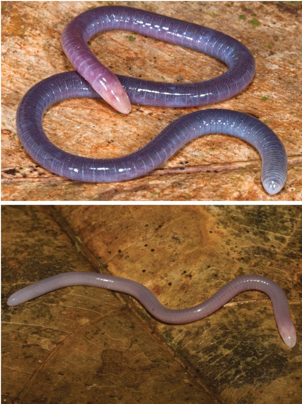
Figure 5. Adult and juvenile Microcaecilia dermatophaga sp. nov. in life. BMNH 2008.721 (top) and one of the three immature paratypes of Microcaecilia dermatophaga sp. nov. (bottom). doi:10.1371/journal.pone.0057756.g005