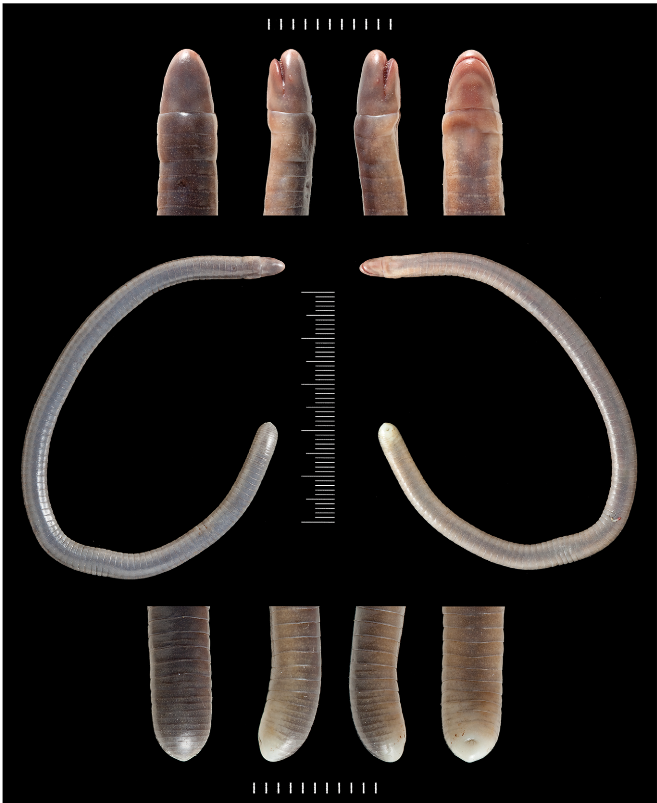
Figure 2. BMNH 2008.715, holotype of Microcaecilia dermatophaga sp. nov. Scale bars in mm. doi:10.1371/journal.pone.0057756.g002

a little paler, much paler midventrally between mandibles and on C1; paler (whitish) around nares, vent, and on posterior half of