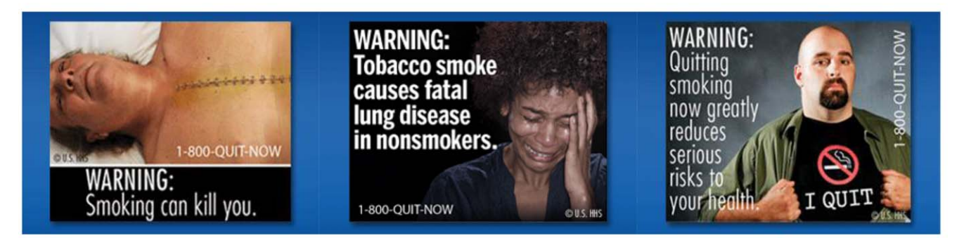
Figure 1. FDA-approved pictorial warning label images. This document includes images of the nine FDA-approved pictorial warning label images used in this study. Reprinted from http://www.fda.gov under a CC BY license, with permission from the FDA, copyright 2012. doi:10.1371/journal.pone.0052206.g001

categories: ready to quit in the next 30 days, the next 6 months or not ready to quit, and was dichotomized as next 30 days vs. next 6 months/not ready.