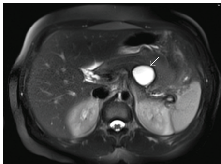
FIGURE 2: Mucinous cystic neoplasm (arrow) on MRI abdomen.

of acute or chronic pancreatitis, differentiation of MCN, even SCA and BD-IPMN, from pseudocysts may be difficult by imaging alone. Pseudocysts typically appear round or oval with a thin, enhancing, possibly calcified capsule on CT. Communication with the pancreatic duct may or may not be present.