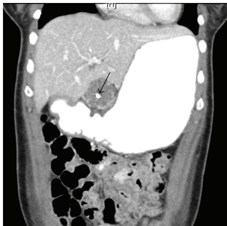
FIGURE 1: Serous cystadenoma with central scar (arrow) on abdominal CT.