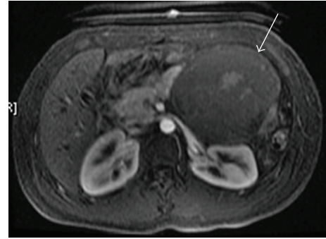
FIGURE 5: SPEN (arrow) with wall, internal septations and hemorrhage on MRI.

Cytologic evaluation of aspirated cyst fluid from fine needle aspiration (FNA) is often performed during EUS but at best has a sensitivity of 34% for mucinous lesions. Glycoprotein tumor antigens, such as carcinoembryonic antigen (CEA), are secreted by epithelium lining mucinous lesions and have been the focus of cyst fluid analysis. A CEA level >192 ng/mL has modest sensitivity (75%) and specificity (84%) for mucinous cystic. However, many mucinous lesions with CEA <192 ng/mL are missed using this cutoff. In addition, cyst fluid CEA level is not predictive of malignancy. Recent interest in DNA mutation analysis from cyst fluid has similarly proven disappointing. Measurement of allelic loss amplitude has a sensitivity of 67% and specificity of 66% for mucinous cystic lesions. The presence of a k-ras mutation