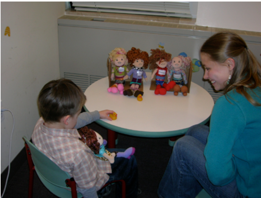
Figure 1: Photograph of study set-up. Participant was seated holding the protagonist with four recipient dolls in front of him/her. The relationships between the protagonist and

Participants helped the protagonist distribute three sets of resources to the recipient dolls (the 2, 3, and 4 resource trials; see Figure 1), then these dolls were removed from the table, and a new block was begun.