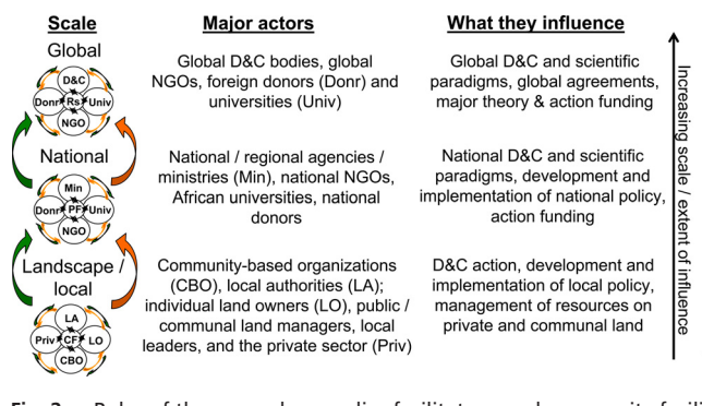
Fig. 2. Roles of the researchers, policy facilitators, and community facilitators in the spanning of boundaries among different actors and what those actors influenced at different scales. D&C, development and conservation; Rs, researchers; PF, policy facilitator; CF, community facilitator.

We then constructed a boundary-spanning team of members, each of whom had a responsibility to span boundaries between institutions at different, nested scales (Fig. 2). At the global level, we asked each of the international scientists on the core team to connect the team's work with international conservation and development organizations and teams [like the United Nations