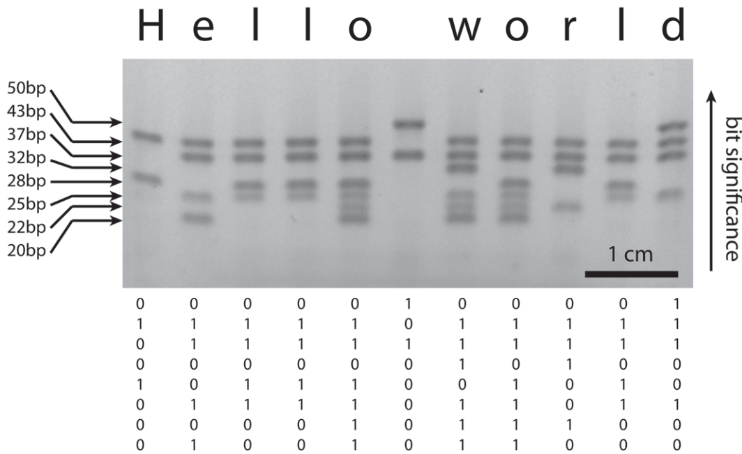
Figure 3. Decoding a binary message on a gel. Each lane of the gel contains a mixture of oligonucleotides which together form an 11 byte binary ASCII message which reads “Hello world”. The bit strings are read from top to bottom with the most significant bit being the largest DNA segment. Presence of a band indicates a binary 1, while absence of a band indicates a binary 0. All lanes have the same amount of DNA present, but only the double stranded pieces dye. doi:10.1371/journal.pone.0044212.g003

expertise, expensive laboratory equipment, or time consuming processes, giving rise to a large asymmetry in effort compared to encrypting and decrypting the message with the proper keys.