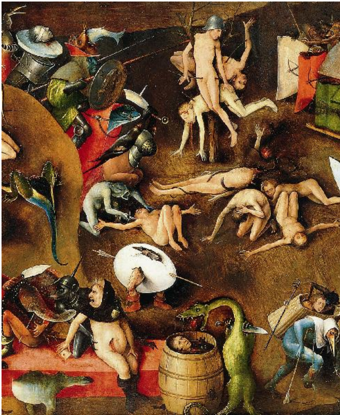
Figure 1. This detail from The Last Judgment by Hieronymus Bosch (1453-1516) illustrates the artist's apocalyptic vision of some of the worst that humans can think, say, or do.