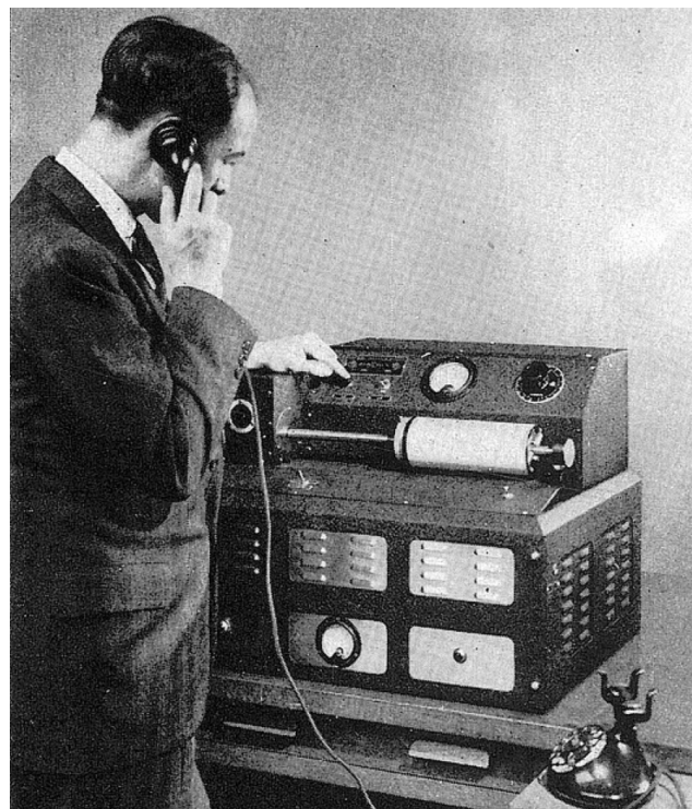
Photos of telegraphic image transfer, from The Complete Photographer (1943).