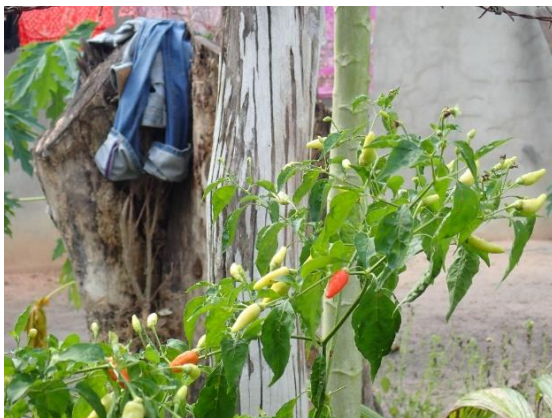
Photo 15. Fruits of “Mates Sor” (No. 65, C. frutescens ) in Pursat Province.