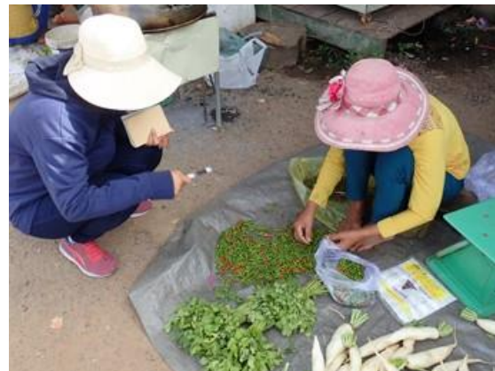
Photo 4. Interviewing a farmer in Pursat market.