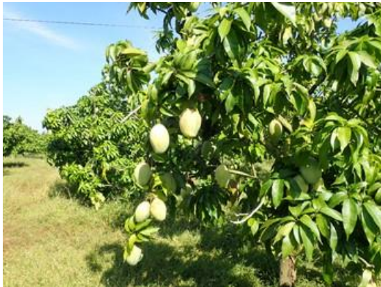
Photo 9. A mango ( Mangifera indica ) field in Kampong Chhnang Province.