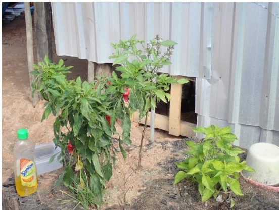
Photo 13. A plant of “Mates Phlaok” (No. 34; left, C. annuum ) in Kandal Province.