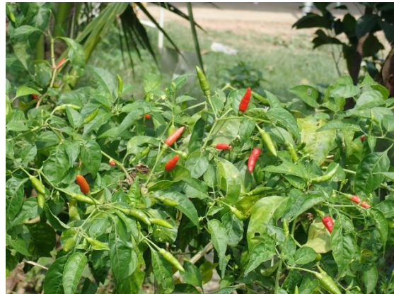
Photo 14. Fruits of “Mates Ach Sath” (No. 70, C. frutescens ) in Battambang Province.