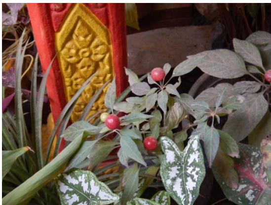
Photo 11. Ornamental Capsicum plants, "Mates Laev Aav" (No. 75, C. annuum ), in Battambang Province.