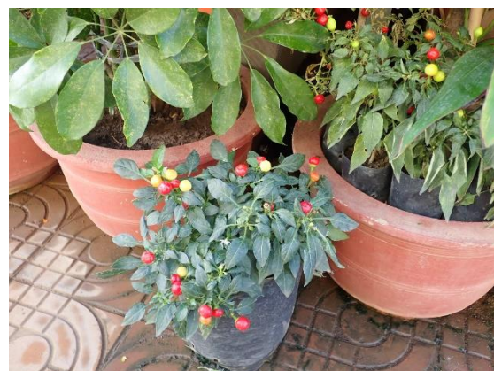
Photo 6. Ornamental Capsicum plants, “Mates Laev Aav” (No. 6, Capsicum annuum ), decorated in front of a mini mart in Kampong Cham Province.