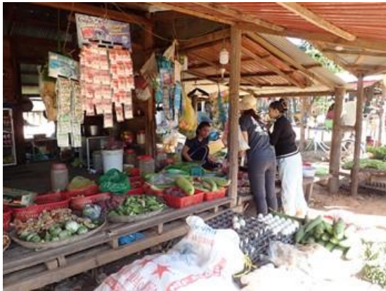
Photo 7. A farmer's shop in Kampong Thom Province.