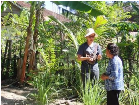
Photo 3. Interviewing a farmer in Kampong Thom Province.