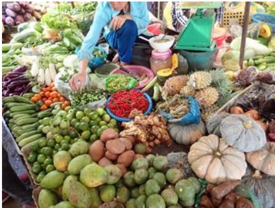
Photo 1. Typical vegetable market. This is a part of Kampong Thom market.