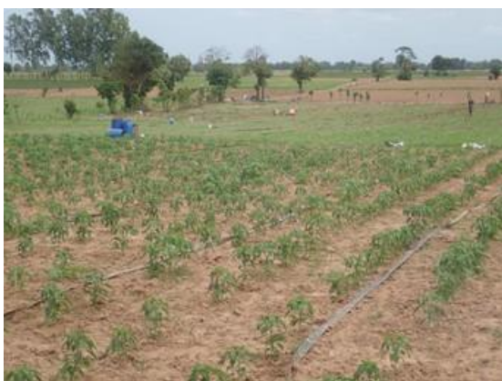
Photo 5. Chili pepper ( Capsicum sp.) field in the east side of the Mekong River in Kampong Cham Province.