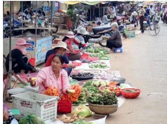
Photo 2. Roadside vegetable market. This is a part of Pursat market.