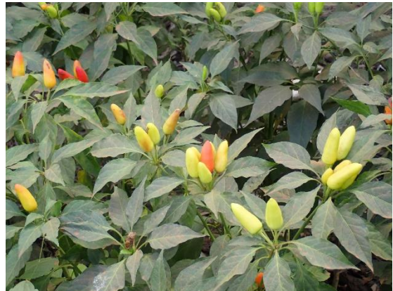
Photo 10. Ornamental Capsicum plants, "Mates Phka" (No. 61, C. annuum ), in Pursat Province.