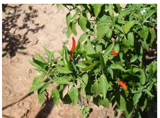
Photo 12. Fruits of "Mates Dai Neang" (No. 22, Capsicum frutescens ) in Kampong Thom Province.