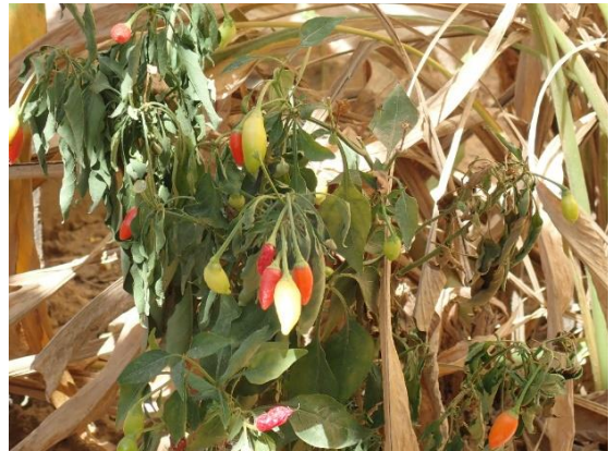
Photo 8. An ornamental Capsicum plant, "Mates Toeu" (No. 24, C. annuum ), in Kampong Thom Province.