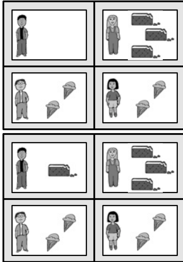
Figure 1: Examples of visual-world displays for (A) some , (B) two , (C) all , and (D) three trials. Participants here were instructed to “Point to the girl that has ____ of the ice cream sandwiches.” The girl with ice cream sandwiches was the Target while the girl with ice cream cones was the Distractor.

The critical utterances differed only in the gender of the child that was requested and the identity of the final word. The character who was requested was called the Target (girl-with-ice-cream-sandwiches) while the one who matched in gender but had a different item was called the Distractor (girl-with-ice-cream-cones). The names of the two items were always compound nouns that shared the same two-syllable onset. Each of the 16 items was rotated through the four quantifier conditions across four presentation lists such that each list contained four items in each condition and each item appeared once in every list.