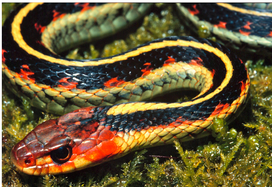
Figure 1. Picture of a common garter snake, Thamnophis sirtalis

Garter snakes are the most studied snake model system in the areas of ecology, evolution, behavior, and physiology. Not only is the breadth of work considerable, but the seminal nature of work in behavior genetics, development of personality, toxin resistance, pheromonal communication, and reproductive physiology places the genus Thamnophis among the major vertebrate models for organismal biology. Garter snakes have provided their most significant contributions as a model to investigate biological questions in the context of natural populations in the wild.