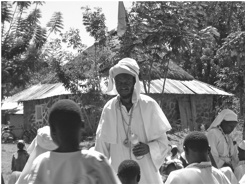
Photo 2. Legio Maria prophet-healers (man center, woman right) at Efeso move among the kneeling congregants dispensing pu hawi (holy water) from plastic bottles. The water is either squirted into the mouth or dispersed over the people using a fly-whisk.

prayers such as the “Hail Mary” with petitions referring to Luo traditional heroes and local geography. In addition, many material elements of Legio religious culture have direct linkages to traditional religious practices. Legio women ring bells in their homes to invite angels to enter and provide protection in much the same way as the ajuoga (traditional practitioner) would call juogi to help alleviate spirit-induced sicknesses. The fly whisk is used by Legio prophets to sprinkle holy water just as the ajuoga used it to asperse the sick with herbal medicines. Legio followers make their rosaries and catenas out of the same otiro and ajua seeds that were important for ornamentation, medication and divination. Finally, perhaps the most important connection was Legio Maria’s recognition of the spiritual etiology of illness. In the traditional religious worldview, sickness and disease frequently are caused by spiritual forces. Legio Maria has acknowledged that the physical world is not a self-contained system but intimately joined to the supernatural. Its prophets and priests assume the traditional role of the ajuoga , calling upon a host of spiritual forces—angels, the Holy Spirit, Baba Messias or Mama Maria—to heal and to exorcise evil spirits. 60