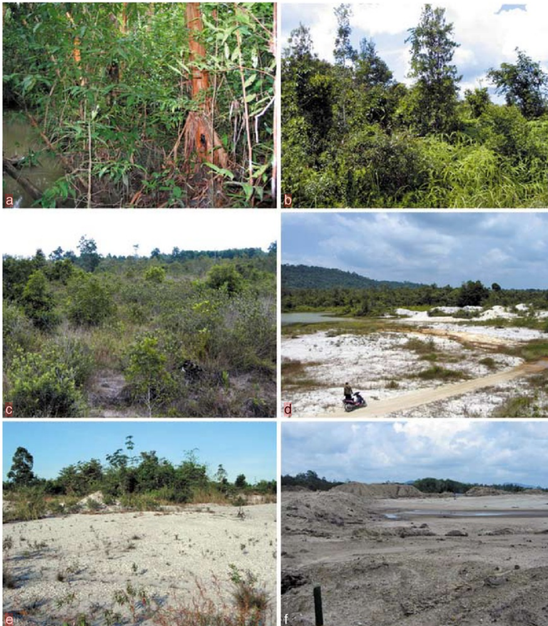
Fig. 2 Vegetation aspects of study sites. a. Riparian forest; b. abandoned farmed-land; c. 38-year old tin-mined land; d. 11-year old tin-mined land; e. 7-year old tin-mined land; f. 0-year old barren tin-mined land.

A minimum study plot size of 0.2 ha per study site was determined on basis of the species-area curve (Setiadi & Muhadiono 2001). The study was conducted on 20 contiguous plots of 10 by 10 m at each of the study sites using the modified quadrat sampling technique of Oosting 1956 (Soerianegara & Indrawan