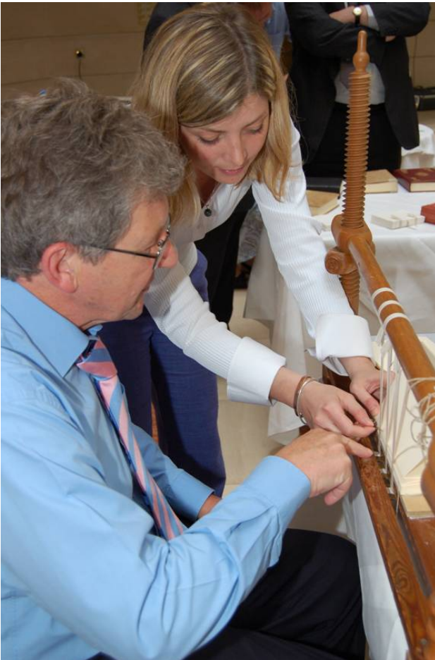
Figure 4. Demonstrating sewing a book at a travelling version of the exhibition