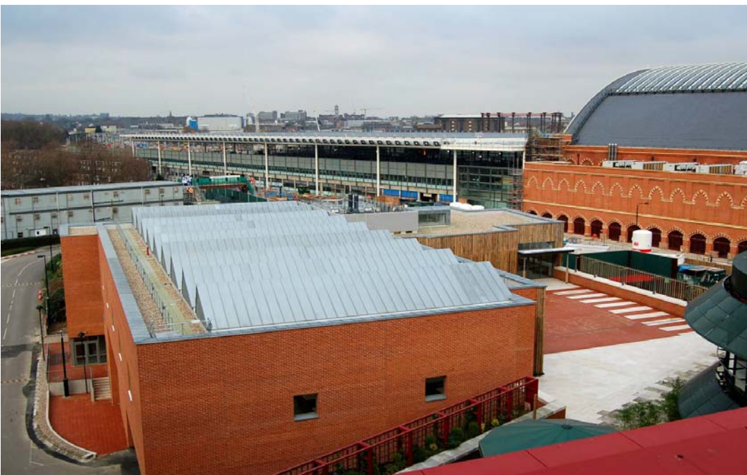
Figure 10. The new Centre for Conservation with saw-toothed roof