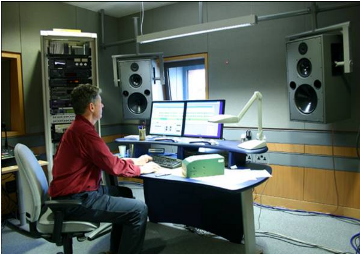
Figure 12. ‘Floating’ sound studio

The lower floor comprises mainly ‘floating’ studios to achieve the very high acoustic specification for audio preservation. The sound studios are built using block work, thermal and acoustic insulation and sit on reinforced concrete slabs ‘floating’ on acoustically isolating rubber pads some 600 mm thick. In addition to the ten sound transfer studios and a recording studio, there is storage for the many recording machines (many becoming obsolete) that the sound archive need to maintain and use. The studios are equipped with high performance machines for carrying out the studio’s main focus of audio transfer. Analogue-to-digital converters aim to guarantee historic recordings are preserved but not modified and a precision-built audio analyser is used to test working equipment and ensure it meets exacting engineering standards set by professionals (Ranft, 2007). The studios prepare audio excerpts for playback in BL exhibitions and sounds for the BL website. One studio is used specifically for live recording of oral history interviews and lectures for the BL’s podcast programme . A sorting area in the Technical Services office prepares collection items for copying and is equipped with a laboratory oven and bath for disc cleaning.