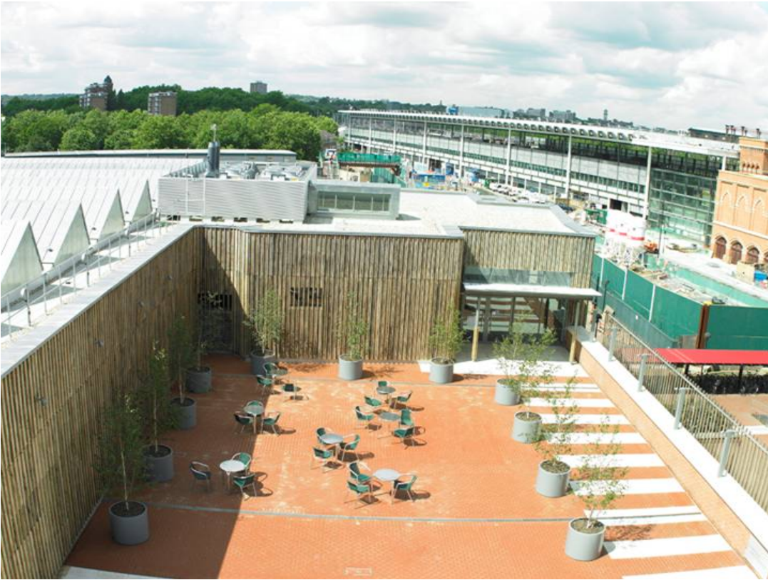
Figure 9. New public terrace joining the main building and the Centre with the new Eurostar station visible behind