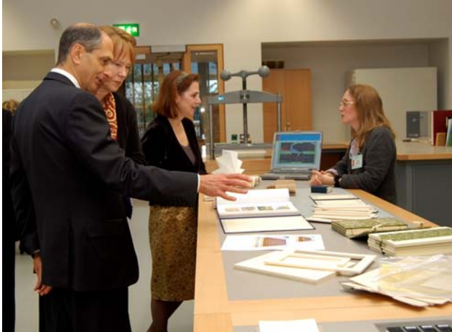
Figure 5. Visitors around the new Conservation studios

There is a programme of demonstrations, workshops and talks for the public on topics such as caring for photographs, family history archive days, as well as conservation advice clinics at weekends.