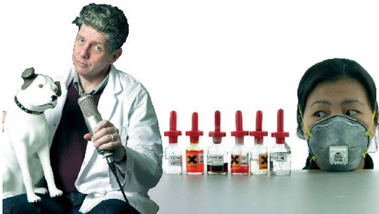
Figure 13. Portrait used for publicity campaign

Since the project had put so much emphasis on the 'change programme' centring on the people in the new building, so the emphasis on the publicity campaign to launch the Centre was put on people, by means of portraits of conservation and sound archive staff. A photographer took portraits of staff who were invited to bring an object or tool that summed up their work – for example, a spoke shave for a book conservator who pares leather; His Master's Voice's iconic dog 'Nipper' chosen by a sound archive technical services manager. The resulting set of about 35 slightly quirky, idiosyncratic portraits has been used in different ways for the publicity, for example in leaflets, in listings and on the websites.