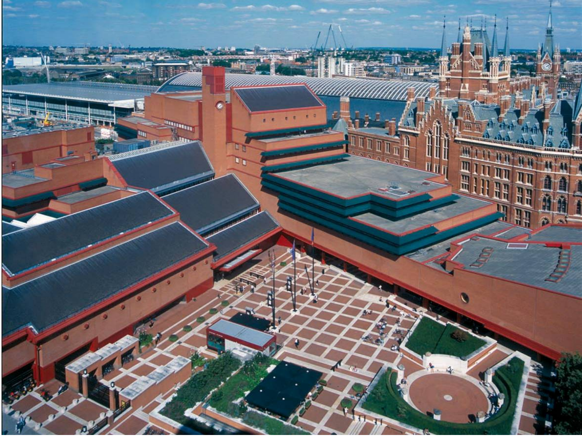
Figure 1. The British Library in the foreground with St. Pancras station behind