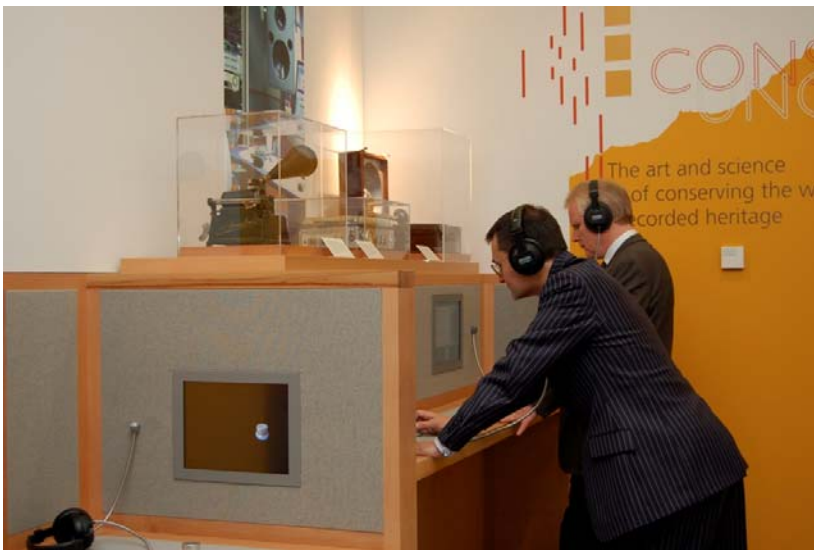
Figures 6, 7, 8. 'Conservation Uncovered': permanent exhibition in the entrance to the Centre with interactive displays on conserving books and sound