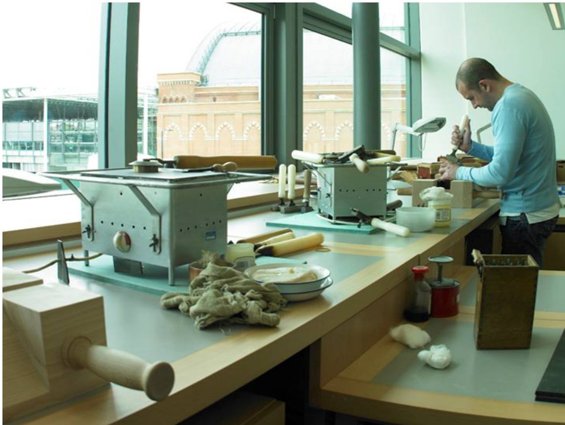
Figure 11. Separate gold finishing studios

In early discussions about having tours by visitors, the conservators had been concerned about feeling as though they were ‘in a zoo’. To address these concerns, the studios cannot be looked into directly from the public terrace. Panelled in American oak that will turn silver in time, there are windows in the exterior walls overlooking the terrace but they have been offset to negate any ‘zoo-like’ feeling. There is a distinct space for gold tooling and finishing. Tooling books in gold leaf is very visual and popular with visitors. The BL has some of the few people in the country skilled in finishing and gold tooling. The studio layout and benches were designed to incorporate demonstrations.