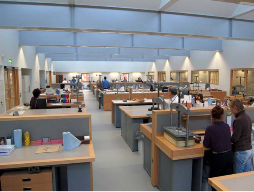
Figure 3. The main Book Conservation studios, around which there are weekly tours for the public