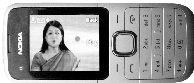
Figure 4: EIA's narrator presenting the TPD through a MAV

Each of the MAVs start with a female narrator, who is the 'expert' voice introducing each TPD focus of the module. What makes EIA's MAV resources for TPD innovative is that the narrator first sets a 'viewing task' prior to the teachers watching the video and then poses reflective questions for them to consider and respond to after practising similar techniques in their own classroom. The expert voice of the narrator enables EIA to move away from the default cascade model of large-scale professional development where information is passed down from the original author, through a range of master trainers, eventually reaching the teacher in an often 'diluted' form (Robbins and Latchem, 2003).