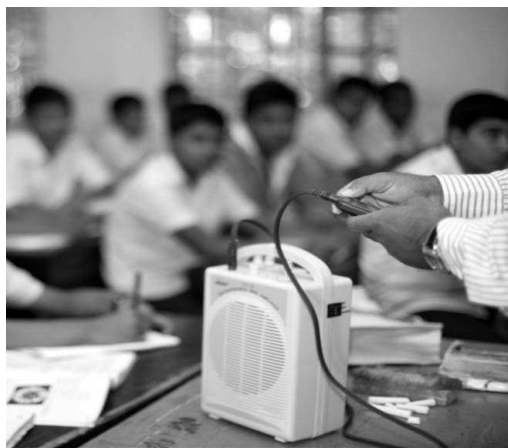
Figure 3: EIA's mobile-phone based technology kit known as "the trainer in your pocket"

EIA was conceptualised to intentionally address issues of scale, embedding and quality for the present and future across rural and urban contexts. Budget constraints of 6000 Bangladeshi Taka (BDT) per teacher (£60) mandated that EIA construct multiple kits to field test and pilot for the current upscaling phase (2012-2015), while also thinking post 2015 when there will much less funding available for the approximately 67,500 teachers to whom EIA will still be required to provide a robust program of TPD. Drawing on our preferable future scenario and the result of our possibility thinking, we chose 2 low-cost alphanumeric mobile phones with 4GB micro SD cards and portable rechargeable speakers and an SD card and portable rechargeable speakers to pilot as three separate kits from March to September (2011) in two rural upazilas. The results of the mobile phone based technology kit were extremely successful with pilot study teachers overwhelmingly reporting satisfaction and success using the kits with their students. This resulted in EIA assembling a new technology kit that was distributed to 12,500 teachers (January - June 2014) across Bangladesh. The kit (Figure 2) consists of the Nokia C1-01 (£35) mobile phone, a portable rechargeable Lane amplifier/speaker (£25) and all of EIA's TPD materials and classroom audio resources on 4 GB micro SD cards (£2). The kit has affectionately become known as the 'trainer in your pocket'