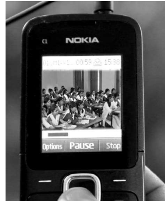
Figure 6: Students engaging in communicative English

Afterwards the narrator comes back on and says: