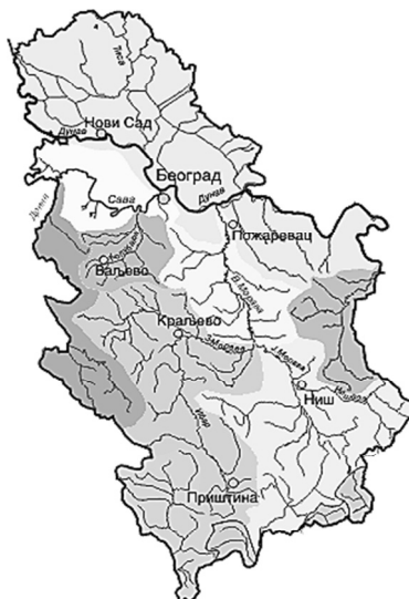
Figure 1. Network of surface water stations - hydrological stations and basins ( http://www.hidmet.gov.rs/ )

Investigated samples were taken from different locations of the watercourse in Serbia (represented in Figure 1). The set of 34 samples of river and lake sediments were taken from: Danube (Black Sea watershed), Sava (Danube watershed), Tisa (Danube watershed), West Morava (Great Morava watershed), Nišava (South Morava watershed), Tamiš (Danube watershed), Topčiderska River (Sava watershed), Kolubara (Sava watershed), Pek (Danube watershed) and Toplica (South Morava watershed).