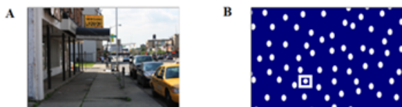
Figure 1. An urban scene used in a scene viewing task, and a sample display with a target circle among ovals, used in visual search tasks included in the new eye movement data for the meta-analysis. The square in the visual search display depicts for the reader, the position of the target in this particular display.

Six of the datasets were from 3 published studies that reported the vertical asymmetry in PSFDs during saccadic exploration (Brown & Greene, 2018; Greene & Brown, 2017; Greene et al., 2014). Eight of the datasets were from 3 published studies of saccadic exploration that had not previously checked for the vertical asymmetry in PSFDs (Foulsham & Kingstone, 2010; Greene, Brown, & Paradis, 2013; Greene, Pollatsek, Masserang, Lee, & Rayner, 2010; Strauss, Ossenfort, & Whearty, 2016). Nine new eye-movement datasets were from the laboratories of the authors, and were included in the analysis, to minimize publication bias. Table 1 presents brief descriptions of the methods utilized for the datasets included in the meta-analysis. Figure 1 shows one urban scene used in previously unpublished scene viewing tasks, and a sample trial display with a target circle among ovals, used in visual search tasks. In one scene-viewing task, the stimuli were randomly chosen webpages, containing pictures and words. All other stimulus sets are well described in the published datasets (see Greene, Brown, & Paradis, 2013; Greene, Pollatsek, Masserang, Lee, & Rayner, 2010; Strauss, Ossenfort, & Whearty, 2016), and briefly described in Table 1.