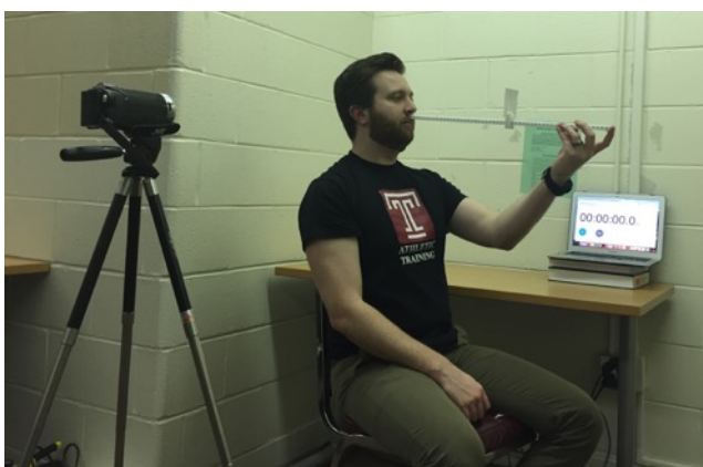
Figure 2. Participant positioning during data collection.

A digital camera mounted on a tri-pod was used to confirm accuracy in hitting the desired target speeds. The camera was set up to the right of the participant such that it could capture that tick marks on the ruler as well as the digital stopwatch in the background of the image (Figure 2). Video of the trials was reviewed after data collections so that target speeds could be calculated by