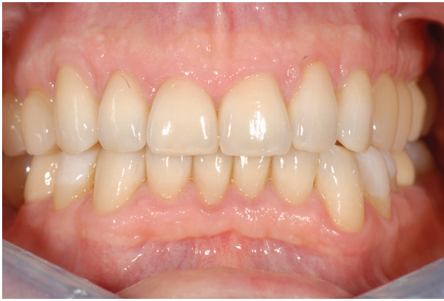
Fig. 3 Final restorations cemented and finished.

complications over the entire observation period 26 and was calculated as the ratio between the number of veneers that did not present complications and the number of total veneers examined. Each complication was considered as a statistical event, cumulative survival was recorded using Kaplan–Meier analysis. All evaluations of potential failures were performed by the same operator at 3-month checks during the observation period, following advices from the literature to detect chipping, fractures, and other causes of failure. 27