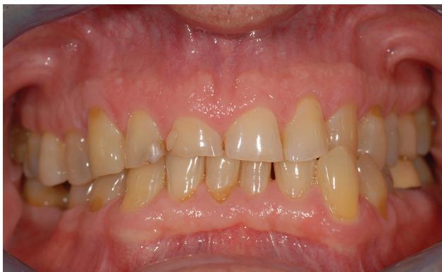
Fig. 1 Patient's conditions at baseline.

Survival was defined as a restoration being free of all