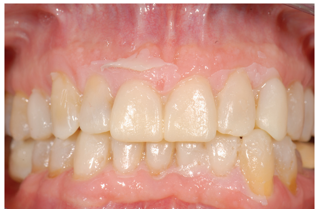
Fig. 2 Mock-up placement.