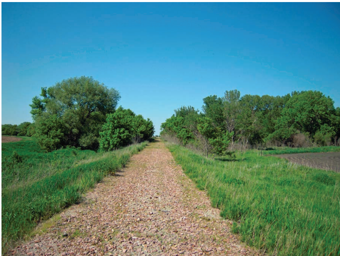
Fig. 3 Swaledale railroad prairie ROW. Note woody succession in abandoned borrow pit on east (R) side of ROW, the original collection site of L. hirsuta . Photograph by the author, 23 May 2012

The frequency of occurrence for L. hirsuta was not quantified at this specific collection site, but it should be noted that duplicate vouchers for certain other associates were observed or collected at various locations within the study area, unlike that for L. hirsuta . A conservative qualitative assessment for the localized occurrence of L. hirsuta on the Swaledale railroad prairie, in my judgment, is infrequent to rare.