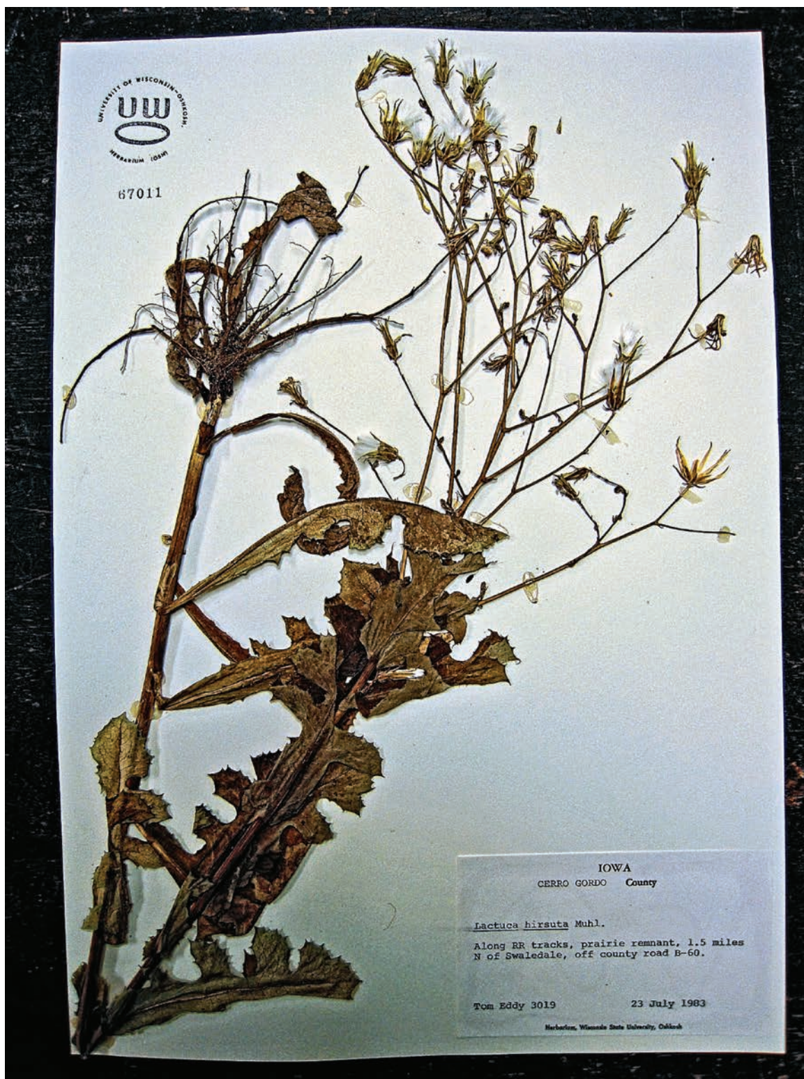
Fig. 1 Lactuca hirsuta collected 23 July 1983, Cerro Gordo County, IA. OSH specimen voucher, accession 67011.