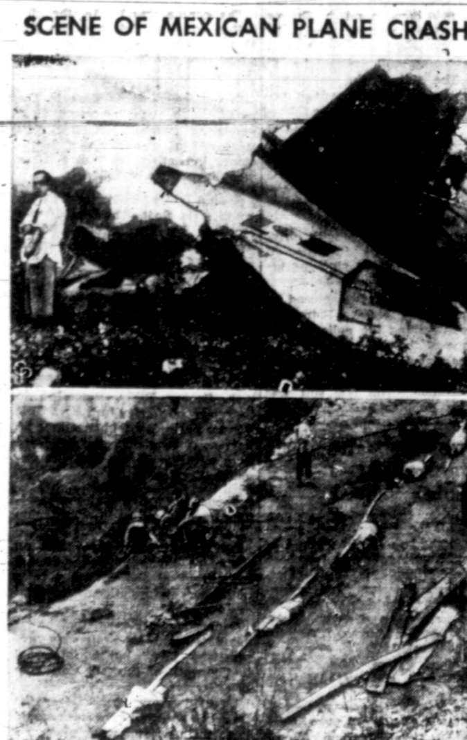
WRECKAGE OF THE DC-3 airliner which crashed near Monterrey, Mexico, while flying to the dedication ceremony at Falcon Dam...