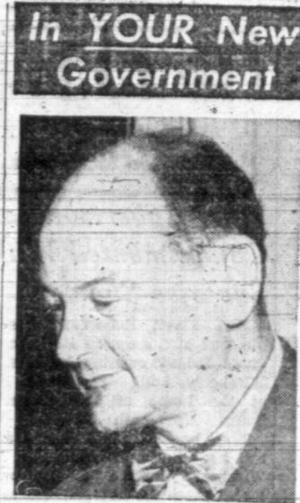
James J. Wadsworth DEPUTY U. S. representative to the UN, and second in command to Henry Cabot Lodge, Jr., is James J. Wadsworth, 47, Genesee, N. Y. Wadsworth, son of the late Senator James W. Wadsworth of New York, until recently was acting Civil Defense administrator. Wadsworth succeeds Ernest Gross in the $20,000-a-year post, which carries ambassador rank. His grandfather, John Hay, was a secretary of state.

no heart-breaking house to house canvassing. We furnish a definite appointment. An old Legal Reserve Company backed by hundreds of thousands of dollars and experience now has positions for men and women with dignity and big earnings. Now is the Time. We have steady responsible positions immediately for men and women 21-60 in Murray and surrounding counties. Write Secured Casualty Agency, Box 627, Paducah, Ky. F3c