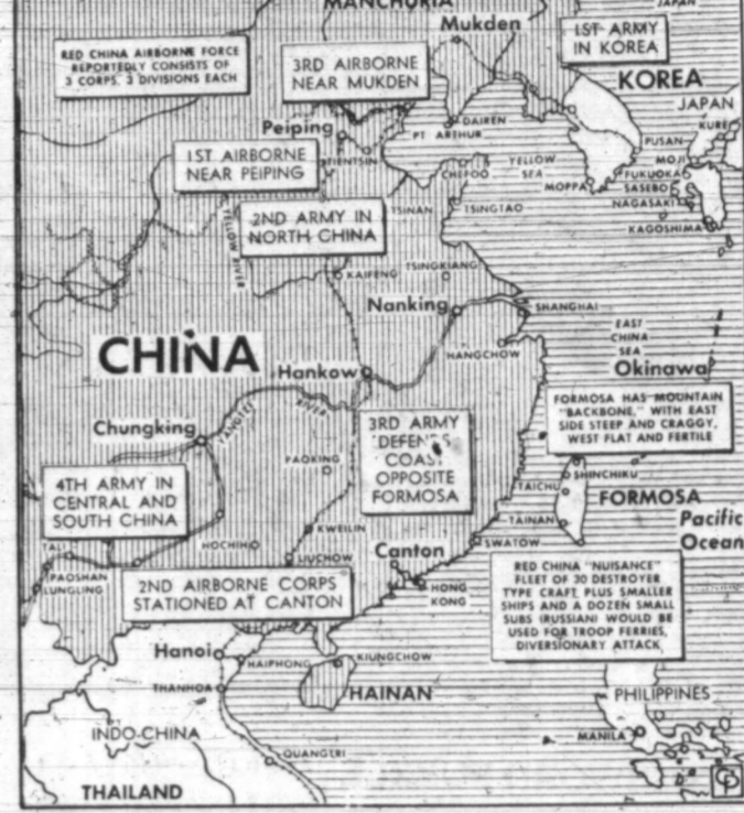
REPORTS FILTERING into Hong Kong indicate Red China is adding to its airborne troop strength in preparation for a "liberation" attack on Nationalist-held Formosa. Map locates Communist airborne concentrations, believed to number more than 90,000 men and expected to reach 150,000 by late spring. Four field armies (also located on map) are estimated to total 3,000,000 regulars. There also are 6,000,000 regional militiamen, tightly armed part-time soldiers, according to estimates.