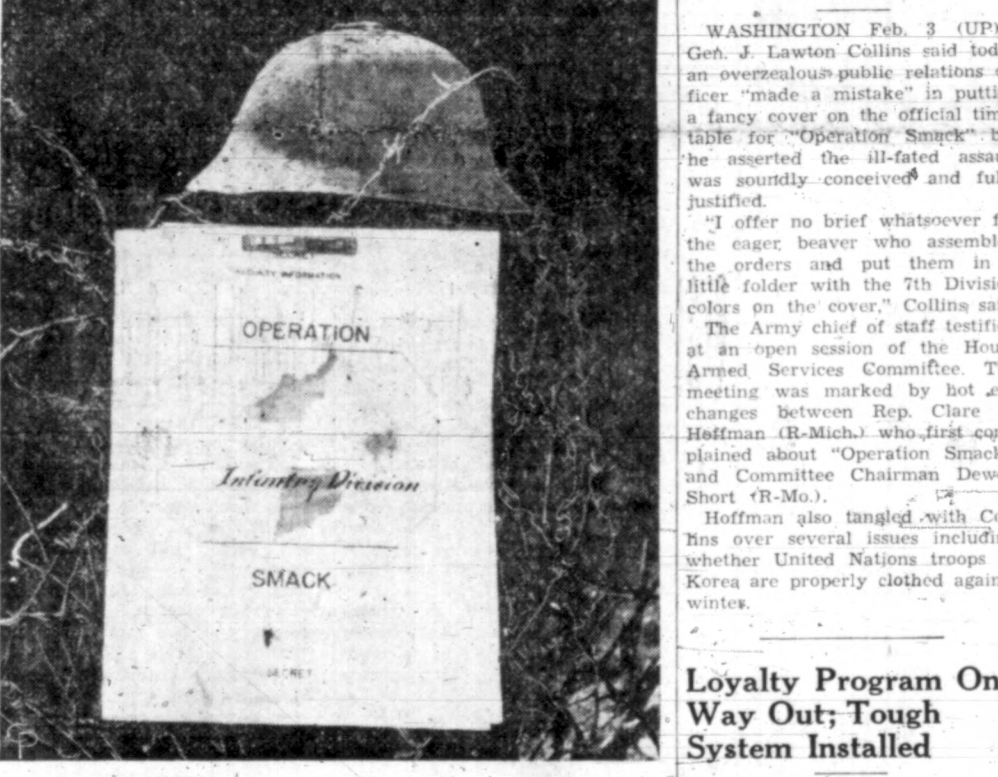
HUNG ON A ROLL of barbed wire and topped by a battered Communist helmet in Korea is the timetable which is being distributed to observers for "Operation Smack" at T-bone hill. An investigation has been demanded in Congress to learn whether the attack, stopped cold by enemy fire, was necessary.