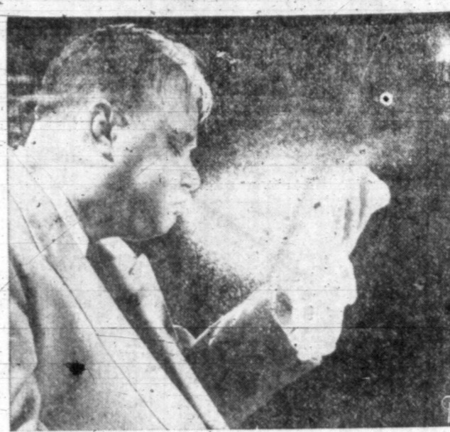
THIS IS A SNEEZE, caught by a high speed camera at 1/10,000th of a second in Detroit in a photo which demonstrates how germ-laden moisture particles can be sprayed far and wide to spread influenza, now rife in the Midwest as well as elsewhere. When you sneeze, hold your handkerchief close to your mouth.