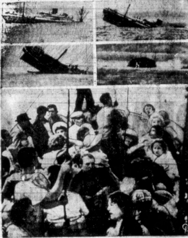
THE DUTCH LINER Klipfontein is shown as it sank after striking a submerged object off the coast of Portuguese East Africa. The 200 passengers and 120 crewmembers were all taken off safely as lifeboats of the Bloomfontein Castle came to the rescue. Below, a crowded lifeboat is brought to the side of the English liner, preparatory to being hoisted aboard.