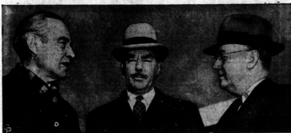
U. S. SECRETARY OF STATE Dean Acheson, W. Averell Harriman (left), Mutual Security Administrator, and John W. Snyder (right), Secretary of the Treasury, are shown at the Washington National Airport just before they boarded a plane for Paris. They will attend the session of the North Atlantic Treaty Council.