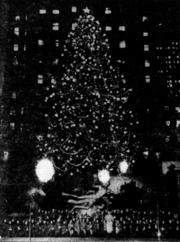
LIGHTS BLAZE from an 85-foot Christmas tree and 100 chortlers sing carols at ceremony which ushered in the traditional holiday activities in Rockefeller Plaza, New York City.