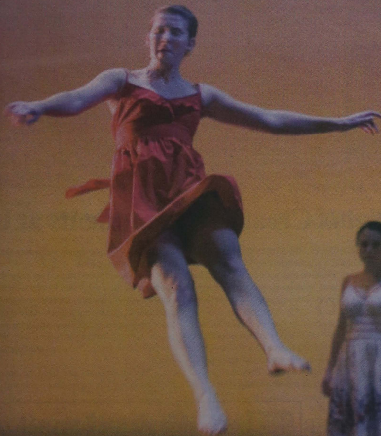
UCDC Dances in the Dark (See Page 4)