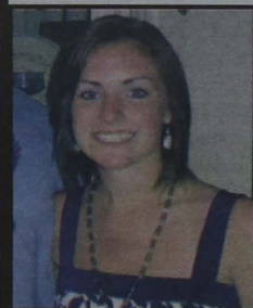
Sports Signoff Sports, 8