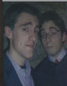
CfD Comes Full Circle Opinions, 6