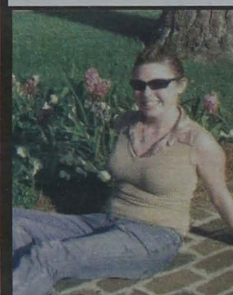
Bowing Out Features, 4