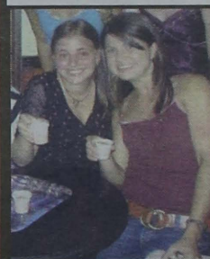
Ciao for Now News, 3