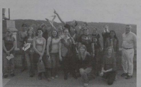
lifestyle is out of consideration. The UC in Tuebingen group poses for a fun shot on a

But I will take up this topic some other time, there is too much to cover. Right now I am in Berlin, so next week maybe I'll write about something more corporeal—one of the liveliest cities in Europe.