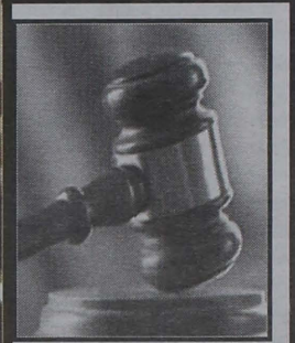
Ex-professor awaits trial News, 3