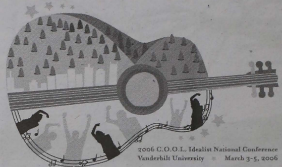
The C.O.O.L. Idealist National Conference is heading to Music City!