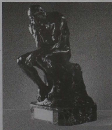
Auguste Rodin, "The Thinker" modeled 1880, reduced in 1903 cast about 1931, Bronze, Foundry Alexis Rudier, 14 3/4 x 7 7/8 x 11 3/8" Iris and B. Gerald Cantor Collection

stretched to end in clenched fists. She wears an expression of intense fury. Under a furrowed brow, two deep holes carved in the face create the effect of dark and shadowy eyes. This is not the face of a beautiful and wise goddess of war. This is a hateful warrior that embodies the horror of warfare and perfectly demonstrates Rodin's unflinching commitment to realism, even when working on a symbolic level.