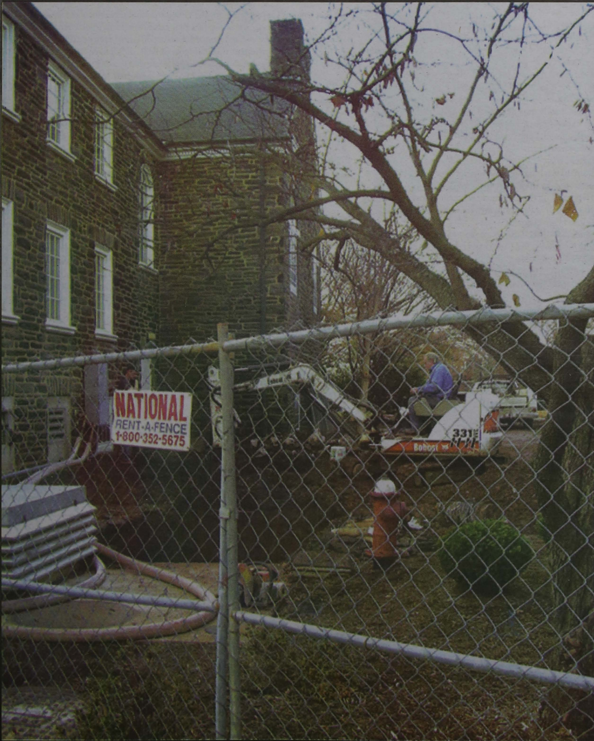
Blocking off Berman

the student newspaper of ursinus college