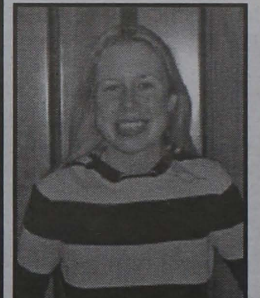
Detecting signs of pregnancy features, 5