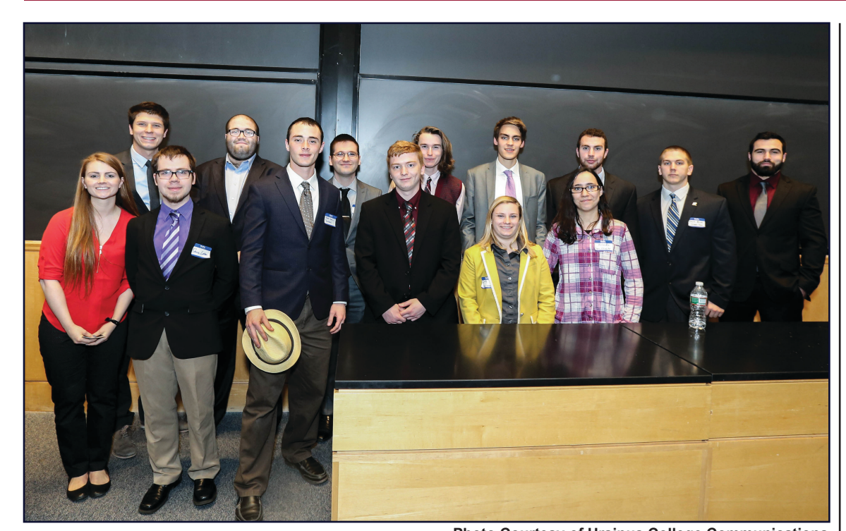
Students pitched their projects in the BEAR Innovation Competition hosted by the U-Imagine Center on April 2.