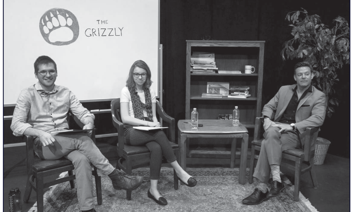
A still from The Grizzly's interview with President Brock Blomberg.