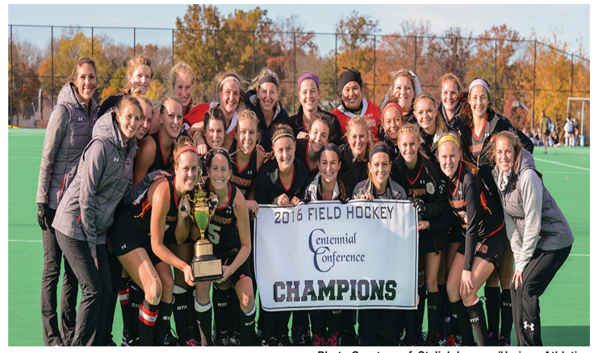
The 2016 women's field hockey team after defeating Franklin & Marshall on Nov. 6 to clinch the Centennial Conference Championship. This marks the fourth championship in as many years for the women.