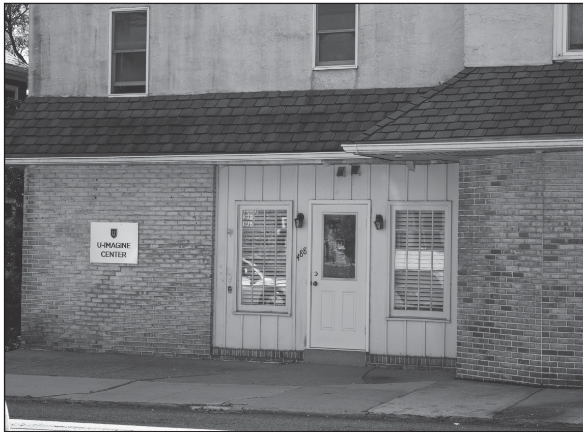
The exterior of the U-Imagine Center, located on Main Street. This weekend, the center will host a symposium featuring several successful women entrepreneurs, including many UC alumni.