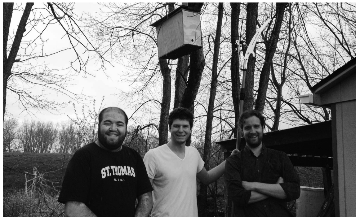
The Ursinus College Beekeeping Society shows off their hive of bee friends at the Organic Farm.

The Beekeeping Society has been making great strides in bringing beekeeping to Ursinus. The Beekeeping Society hopes to share their passion and knowledge with the rest of the community as they continue to grow as beekeepers and educators.