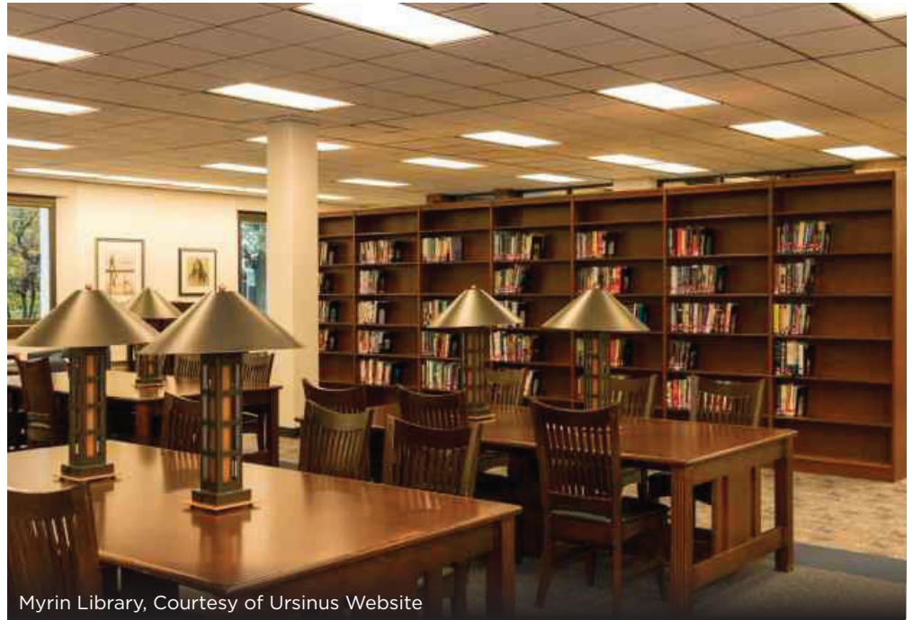
Myrin Library

a investigation is when he visited an old farm house in Doylestown. The house had been previously vandalized. However, his team had gotten permission from the owners of the house to do an investigation and see if there was any paranormal activity there.