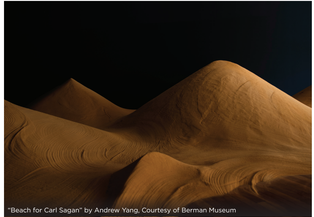
“Beach for Carl Sagan” by Andrew Yang

As we continue to look, we hone this list, refine it, add to it, shift its direction as we see