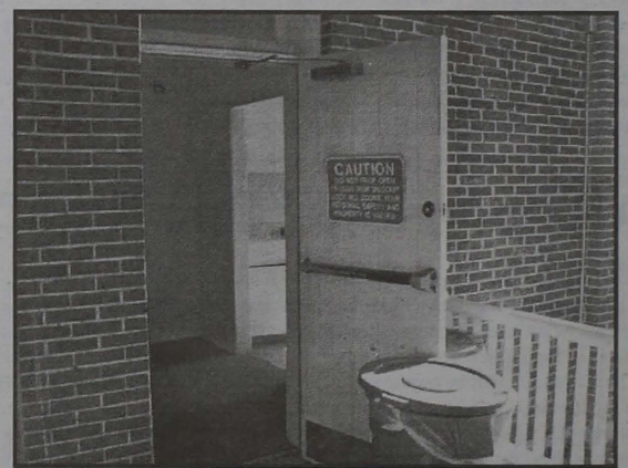
Propped-open doors, like this one at Schreiner, present real safety risks

Overall, students are comfortable with the present situation; they feel safe and secure. Campus safety has succeeded in its task and continues to do so.