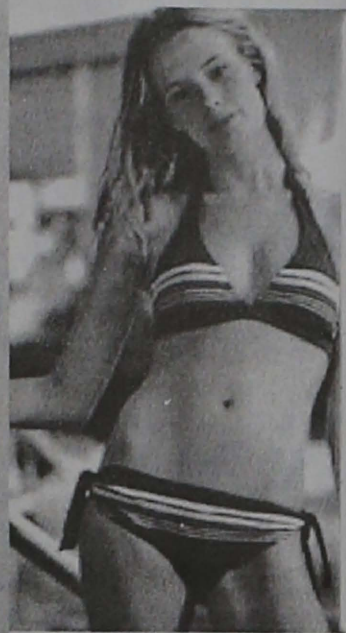
American Eagle Swimsuits www.ae.com

For a more stylish suit, check out the Bebe online store ( www.Bebe.com ). This site of