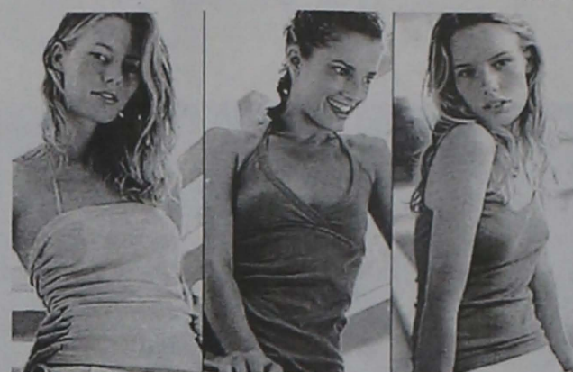
American Eagle Tank Tops www.ae.com

Before it gets too warm out and the prices go up, make sure you get out and get your new wardrobe for the upcoming spring season. When you pick up that new mini and polo don't forget to pick up a cute pair of flip flops! If you have any tips for new spring fashion please email The Grizzly at grizzly@ursinus.edu