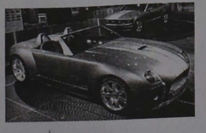
Best in Show Ford Shelby Cobra

This year's best in show goes to the Ford Shelby Cobra Concept.