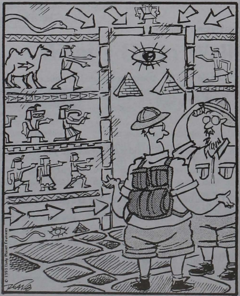
"Well Dr. Stone, it looks like we've reached a dead end. I can't decipher these hieroglyphics, and without them we'll never find the hidden chamber."