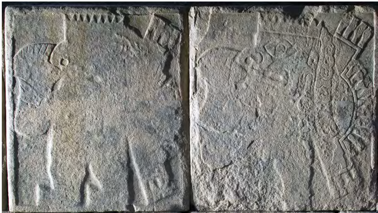
Figure 3: Pututu -playing personages are positioned as if in procession on human-level facing stones encircling the interior wall of Chavín’s 21-meter-diameter, countersunk Circular Plaza, a ceremonial locus where pututus figure prominently in diverse forms of evidence.