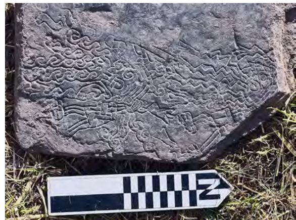
Figure 9: An engraved stone excavated from Chavín's northeastern Esplanade in 2014 depicts two humanoid figures with curvy and jagged lines as if emanating from their mouths (for scale, the smallest division of the north arrow is 1 cm). The photo from which this image was cropped appeared as Figure 55 in that season's annual public bulletin, captioned: "Figure 55. Detail of the base of the cyst, now removed, with representation of two personages spewing rays and waves from their mouths. The formal limits of the stone, and probably of the representations themselves, constrain the figures which extend to [two] extremes" (author's translation), (PIACCDH 2014:50).

The pututu, activated in Chavín ritual performance, interconnected its performer with air by emitting breath and voicings into the air; in this way a pututu performer could command, address, embody, or otherwise