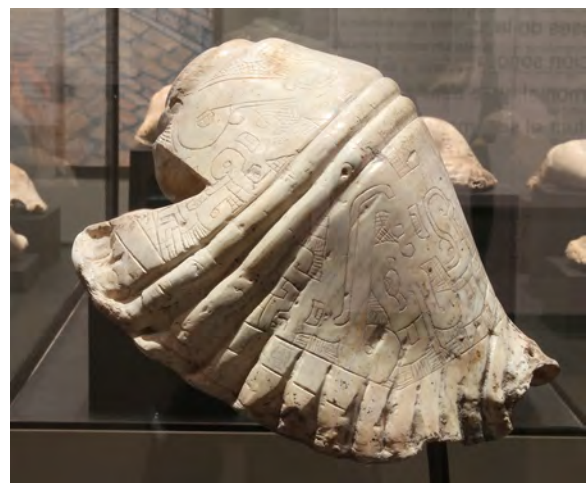
Figure 4. A Chavín pututu on display at the Museo Nacional Chavín. The pronounced notch to the upper/apical lip combined with linear engravings suggests the contours of an avian wing and feathers.