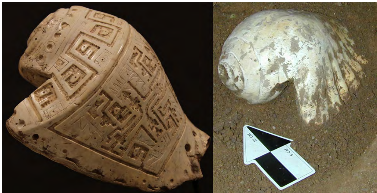
Figure 2: Chavín pututus on display at the Museo Nacional Chavín (left) and another in its 2001 excavation context (right). Composite figure previously published in article by Kolar, Acoustics Today (14/4: 29; Fig. 1).

At Andean Formative Chavín, pututus were a specifically procured, crafted, and emplaced communication technology, transported far from the ocean to this remote highland site. These conch-shell horns were engineered and skill-requisite ritual instruments with social, religious, musical, and conceptual implications. Disentangling these factors and identifying specific symbolical meanings requires knowledge beyond what is archaeologically recoverable. However, evaluating relationships among forms of archaeological evidence—especially site-instrument dynamical interrelationships, for realistic use interpretation of these pututus —produces nuanced assessments of plausibility. Reframing the discussion of Chavín ritual via exploration of its communication technologies injects new,