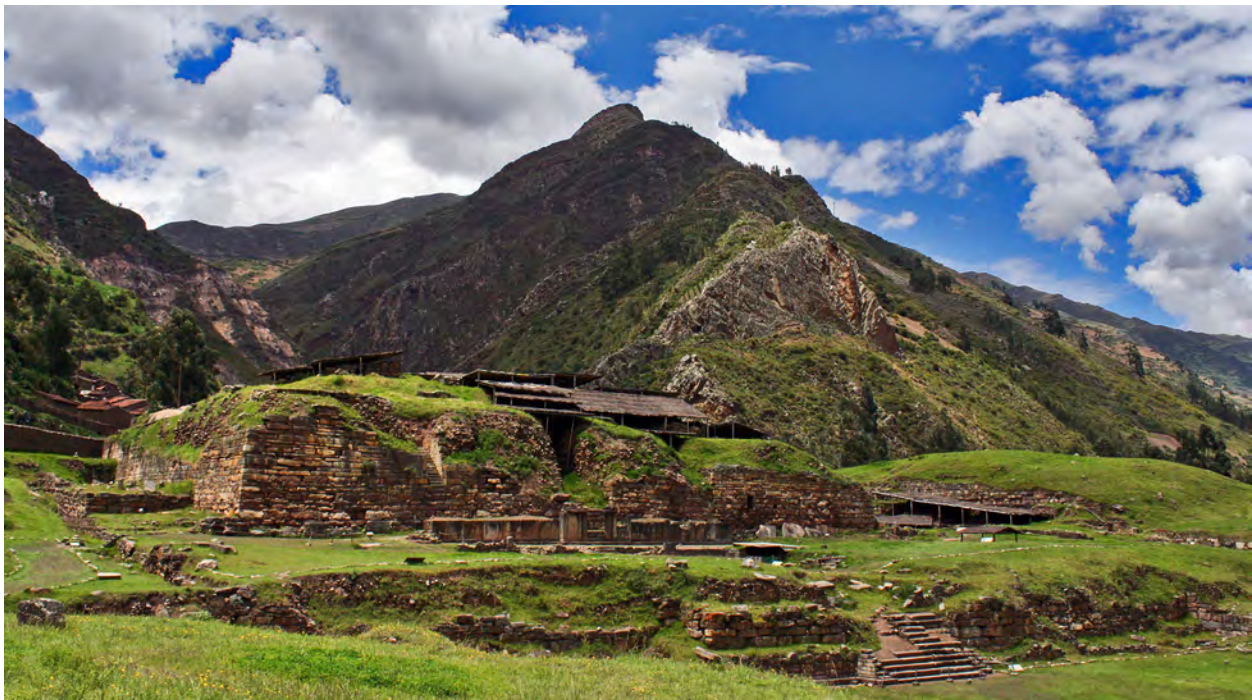
Figure 1: Monumental stone-and-earthen-mortar architecture of the UNESCO World Heritage site at Chavín de Huántar, Perú, as it appeared during the sierran rainy season a few years ago. During monumental occupation, building facades were lined with sculptural anthro-zoomorphic tenon heads ( cabezas clavas in Spanish), with polished stone surface treatments on some areas, including the so-called Black and White Staircase in the right lower corner of this photo taken from southeast of Building A, with the countersunk, square-shaped Plaza Mayor in the foreground.

and funneled water from the converging Wacheqsa River into it through a complex system of stone-lined canals. Several thousand meters of canals, with patterns of associated access stairways and architectural hydraulic manipulations, suggest elaborate water ritual, including plentiful sacrificing of finely constructed, hand-burnished and relief-sculpted ceramics. 18 The buildings have withstood repeated earthquakes and alluvial injection, with evidence of a retrofit repair associated with the end of monumental occupation. 19 Through innovative architectonic and hydraulic engineering, 20 Chavín evinces its builders’ awareness of their role as risk-managing constructors 21 of a “place apart,” 22 activated in ritual as “an intentionally constructed alternative reality” 23 where people from diverse sites and regions congregated to support an experientially distinct ideological system.