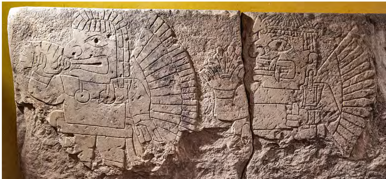
Figure 8: Winged, seashell-bearing personages are depicted on this relief-carved cornice stone that would have projected outward along a building exterior, in a skyward position to be seen from below. The left-most figure holds a pututu to its mouth.

Although we cannot ascertain meaning from stone carvings, the prominent positioning of pututu-personages and superhuman beings suggests that Chavín operationalized these images; well-established models for site ritual founded in material evidence corroborate my contention that Chavín ritual leaders would have leveraged associated narratives. Real-life instantiations of such beings may have been produced by theatrically and psychotropically enlivening them through ritual enactments; performances could have induced trancing and other flow-state experiences, further deepening the otherworldly power of Chavín by incarnating