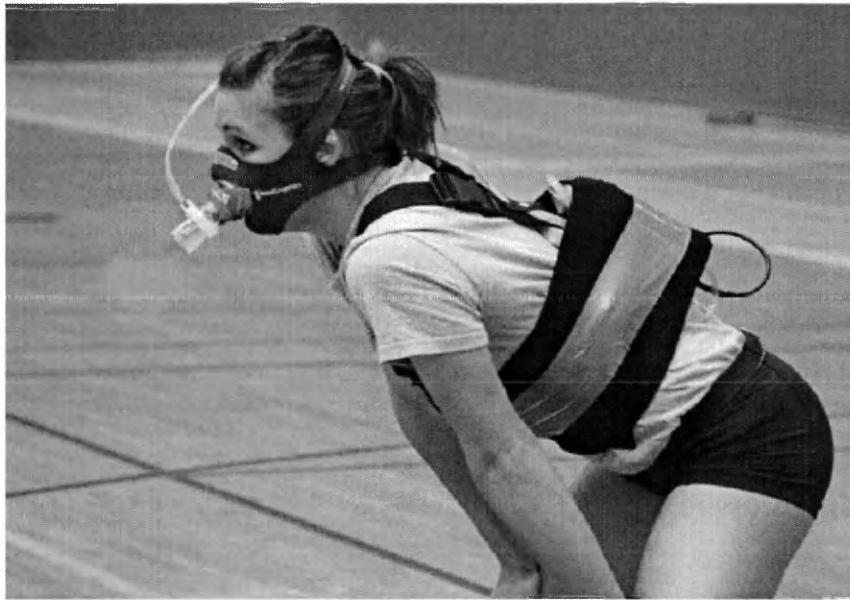
Figure 2. Side view of athlete showing fit of VO2000 analyzer module on the back and cushioned with thick sponge and secured with neoprene belt and tape.