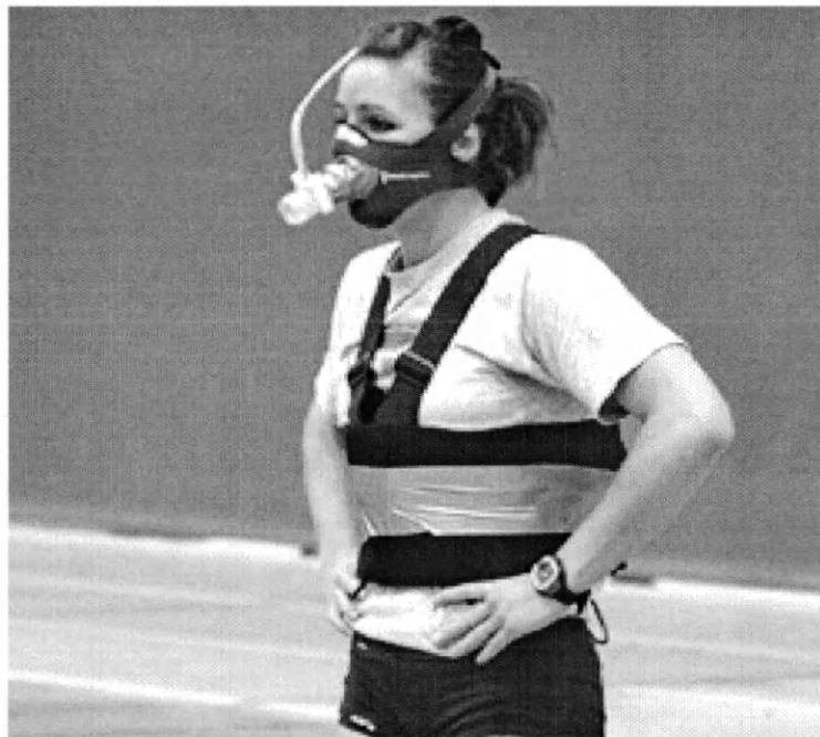
Figure 1. Athlete fitted with VO2000: face mask with pneumotach, umbilical cord running overhead and connected to the main analyzer worn on the back, and battery pack mounted in harness on the chest and secured with neoprene belt and tape.

the UNO Exercise Physiology Lab to record demographic information and to perform a familiarization exercise test while wearing the portable metabolic unit. This allowed subjects to experience exercise while wearing this apparatus. All team practice sessions were performed in the UNO Sapp Field House or the HPER building while under the direct supervision of the team coaches.