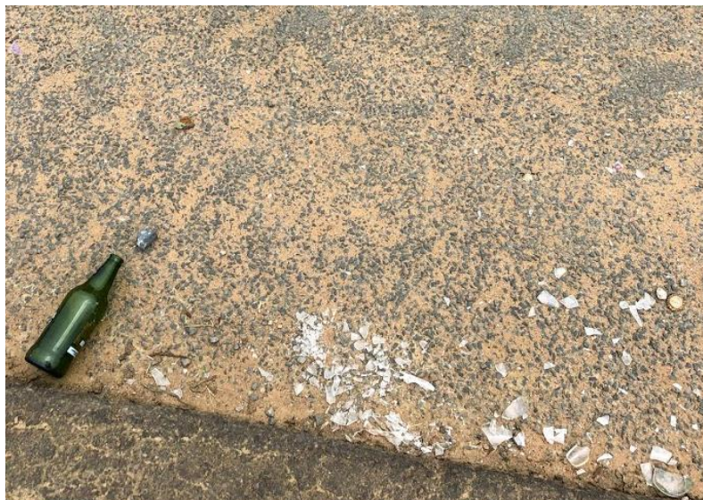
Sunday, November 24 th : A beer bottle and broken glass in the street on Sandgate Road.

I nodded, and turned my puffy, red eyes out the window, only to see that it had begun to rain.