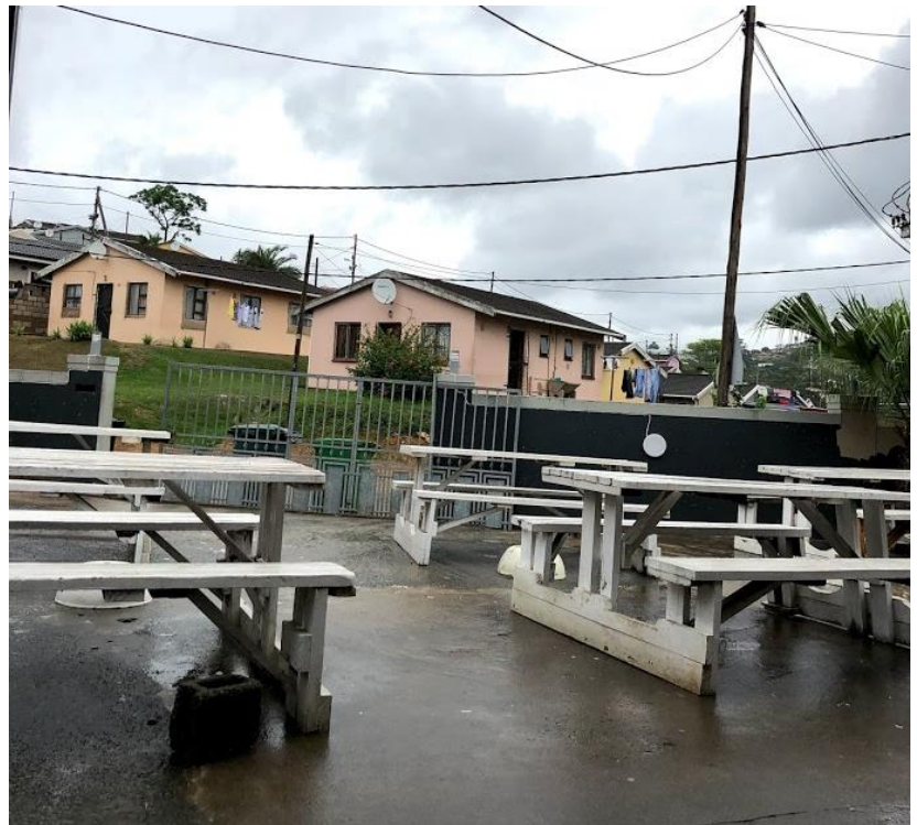
Friday, November 15 th : Inside Café Skyzers after an interview on a rainy day

to carry my conversations with participants. I used this interview guide merely as a method by which to direct the conversation but did not strictly adhere to the written questions. I wanted the interviews to flow like a casual conversation so participants wouldn't feel pressured or like they were being interrogated. Five of these interviews were conducted with people I had met (or friends of the people I had met) during my 5-week homestay in Cato. Kramp states that “context enables the researcher to make meaning where previously there was no meaning. So they typically study