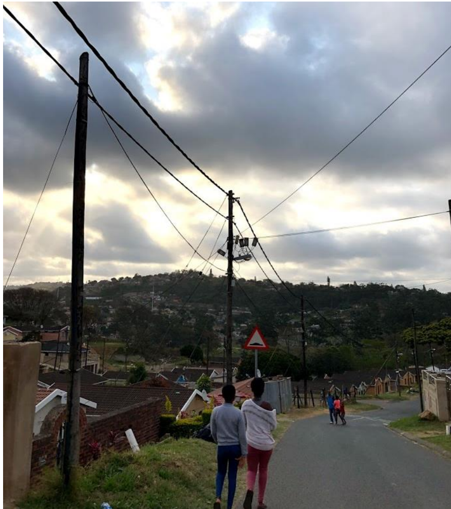
Sunday, September 15 th : A picture from my walk around Cato with my sisi. As the sun was setting, the children playing in the street headed home.