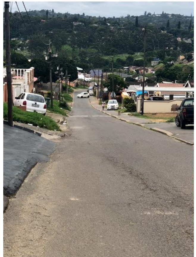
Sunday, November 24 th : The view from the top of Gardens Drive.