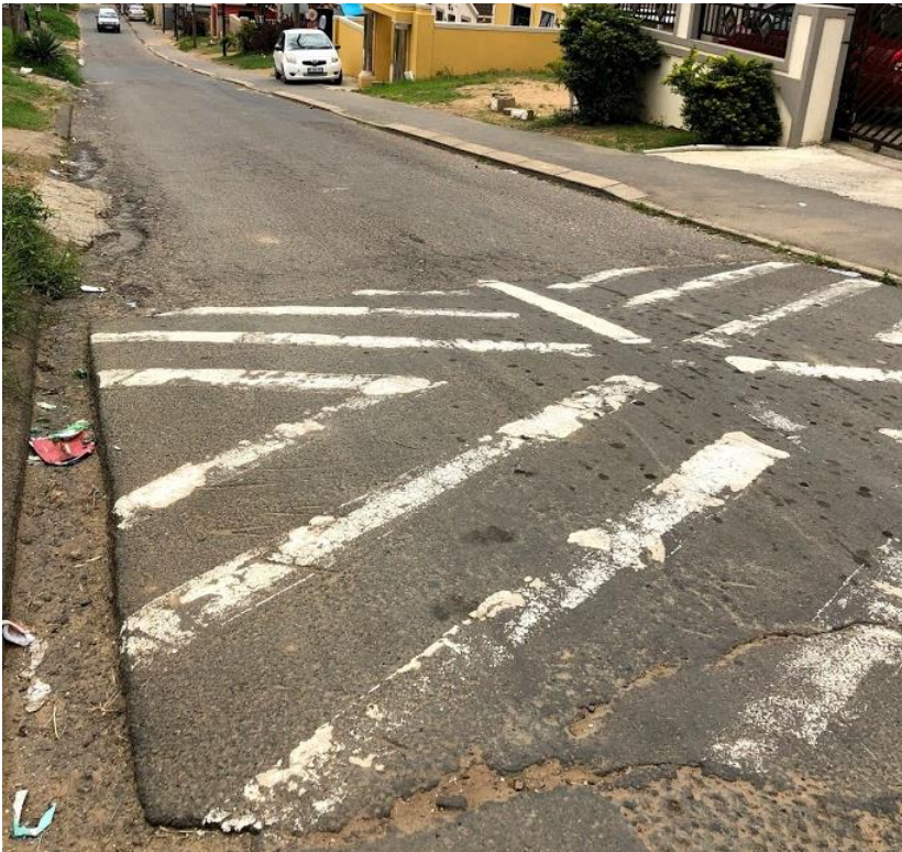
Sunday, November 24 th : A ‘recently’ constructed speed bump on Gardens Drive.

Some participants mentioned the efficacy of speed bumps in reducing pedestrian injuries in Cato, even in the last ten years. In addition, some participants recommended health and injury treatment education as a way to reduce the negative impacts of common childhood injuries.