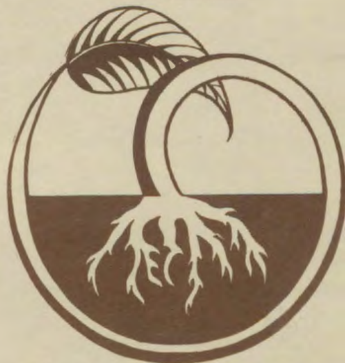
The new logo of The Environmental Center, by Gay Roselle