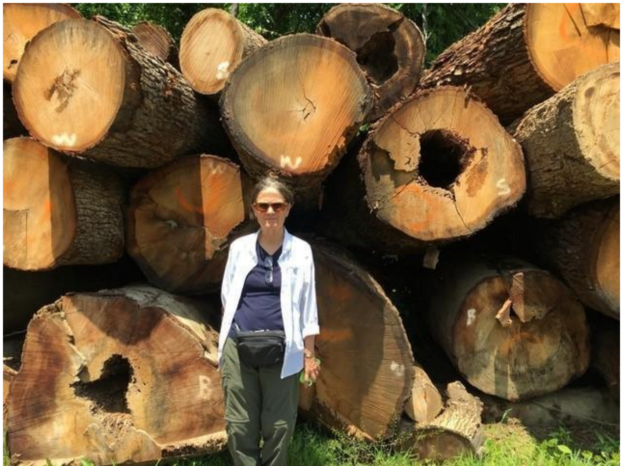
Image 1: A snippet of the 700 mature trees removed and recycled as part of the 2018 Granite Pipeline project through Gwynns Falls Leakin Park, Baltimore City, MD.