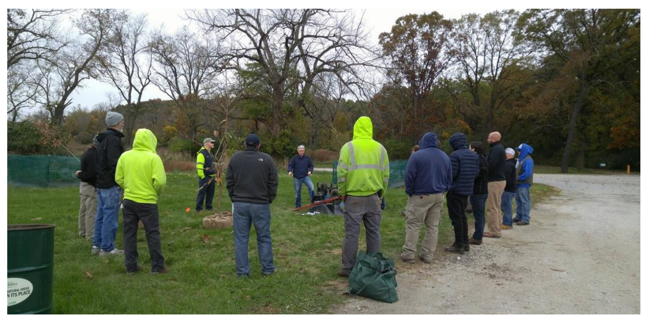
Image 1. City of Chicago Forester teaching tree planting techniques for balled and burlapped trees at a Community Tree Network.

• Implementation: Implementation of the Master Plan is planned for six five-year phases. In Phase I, The Foundation Phase, we are focusing on our first goal: Inspire people to value trees. By starting with this as a base we will be able to get people to stop and take a look at the trees around them, understand that they need proper care and planting, inspire them to care for the trees on their properties (70% of all of our trees), advocate in their communities for better policies and leadership that supports trees, and get them to be active tree stewards in their communities.