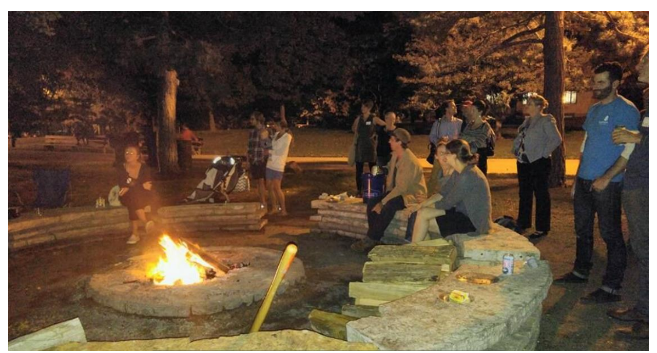
Image 2. CRTI Annual Meeting and Celebration Event hosted by the Chicago Park District