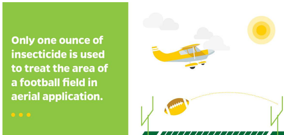
Figure 4. Example of graphics without characters.