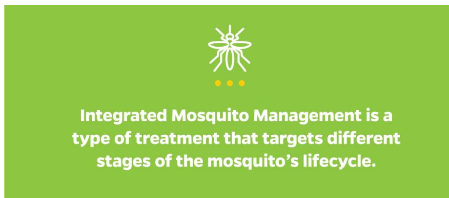
Figure 2. Example of text graphic without characters.

included in five types of content posts: (a) text graphics without the two characters (Figure 2); (b) text graphics with the two characters (Figure 3); (c) graphics without the characters (Figure 4); (d) graphics with the characters (Figure 5); and (e) and a kinetic typography video, a form of video comprised of animated text.