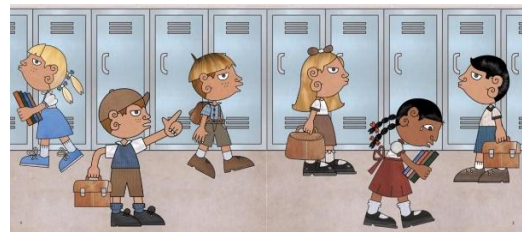
Figure 1. Individual racism

This action of prejudice is strongly depicted in figure 1