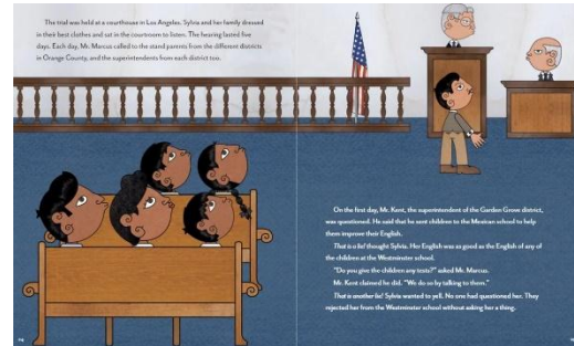
Figure 4. Institutional racism in court

back, there is a small seedy building. It may be that the building is never repainted so it seems dark and gives an impression of unhappiness. Second, there must be a convenient facility that facilitate students for eating such as canteen, garden, etc. In fact, the illustration shows there are four children sitting in a large field while eating lunch. They sit anywhere and ignoring cleanliness around them. It cause, there are many flies over the children's head. Instead of a playground or park, on the outside of the school fence, there are two cows and one of them is pooping. The symbolism of cows represent if non-white children are equal to the animal. It is said to be equal because the place they eat and the place they sit are in the same place which are dirty and smelly. Lastly, if we look at the color displayed, the picture illustrates that Mexican school as a gloomy school because all the equipment such as the ground and the sky are brown and there is no other view apart from dirty buildings and cows.