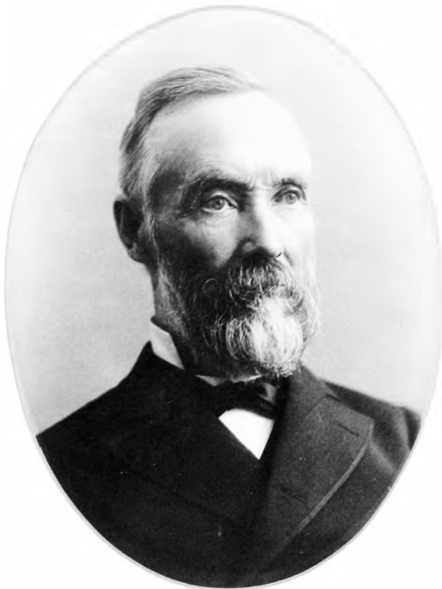
SEBASTIAN STREETER MARBLE Courtesy Maine Historic Preservation Commission