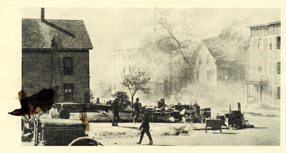
Fighting the flames at Auburn

THE State of Maine in 1933 had two fire disasters within eight days of each other. In the city of Ellsworth, 102 families were made homeless by a fire which started during the night of May 7th. In Auburn, an even worse fire occurred on May 15th, when 457 families became its victims. The two fires affected more than 2,800 people and caused losses in excess of $4,000,000. In both disasters, representatives of the national organization of the Red Cross were on hand before the embers had cooled, to organize relief. And it was the first time in history that the Red Cross accepted funds from outside states for the relief of disaster victims within the State of Maine. An appeal for funds brought in from all sources $99,166.14 which was spent for the benefit