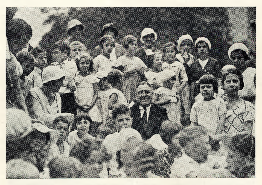
Children of the fire gather about the Relief Director at a distribution of toys by the Junior Red Cross

A splendid piece of emergency work was done by the Lewiston-Auburn Chapter. A fleet of trucks carrying Red Cross flags