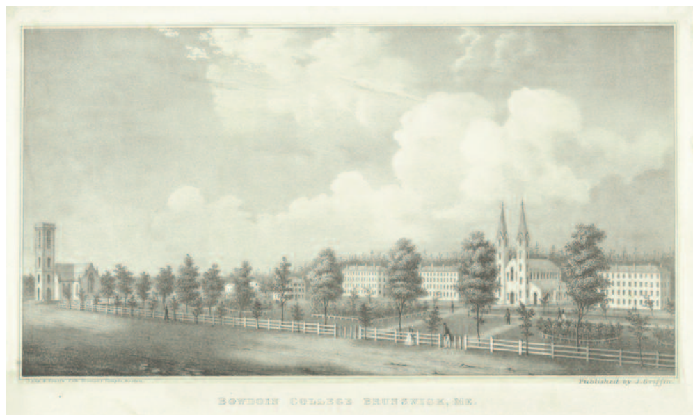
Lithograph showing the campus of Bowdoin College, circa 1845. At the time of the founding of the Medical School of Maine, the only post-secondary school in the state was Bowdoin College, founded in 1794.