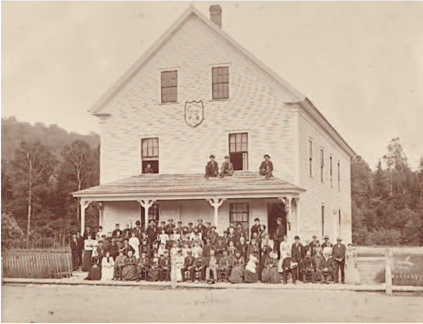
Photograph of grange members gathered outside of the Franklin Grange Hall, Bryant Pond, ca. 1892. Farmers often met at the local grange hall to debate the merits of capitalizing agriculture. Often these ideas would find their way into the rural press.

pressed their independence from the culture of industrial and market capitalism. Their way of life was rich in intellectual rewards and in the satisfaction of a close relation to the land. Their agricultural methods were foundational to the cultural authority they preached. While not averse to turning a profit, they saw limits to agricultural growth. If profit margins interfered with independence and community structure, they questioned large-scale production.