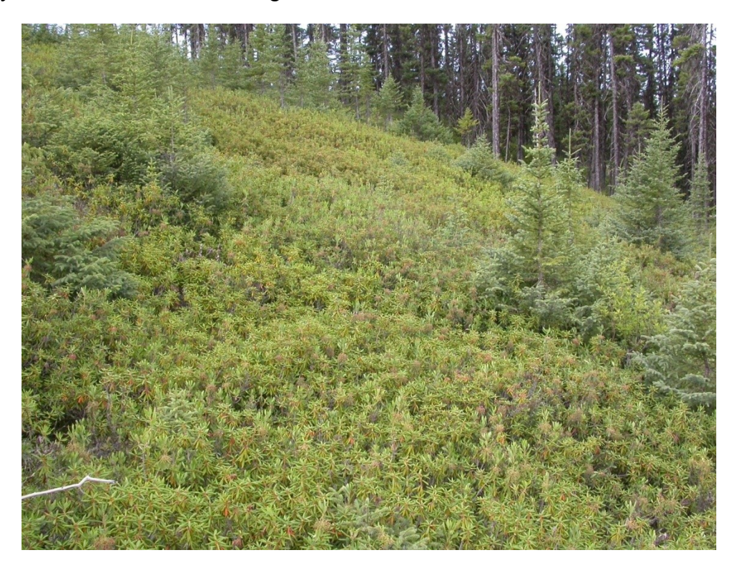
Figure 1. Site dominance by ericaceous shrubs, such as Kalmia angustifolia and Rhododendron groenlandicum , after harvest has a significant impact for forest succession, ecosystem structure and functioning.

Paludification is a second mechanism by which regenerating boreal forest stands are halted or limited through peat accumulation (mainly Sphagnum ) initiated directly over a formerly mesic mineral soil [15] (Figure 2). Through this process, rooting zone temperatures, organic matter decomposition rates, microbial activity, and soil nutrient availability are reduced [16]. The alteration of these production factors leads to a decline in forest productivity [17], with significant impacts on forest management sustainability.